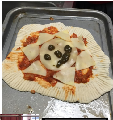
4J's Argentinian pizza